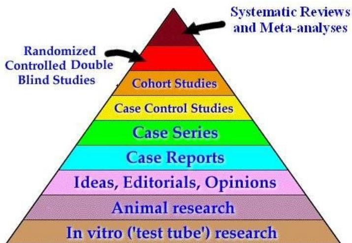
Figure 1: Nature of the available information